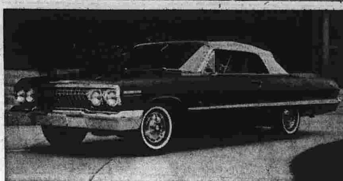
New Line of Chevrolets at Carter's Here is the luxurious Impala convertible, one of the 33 new Chevrolet models...